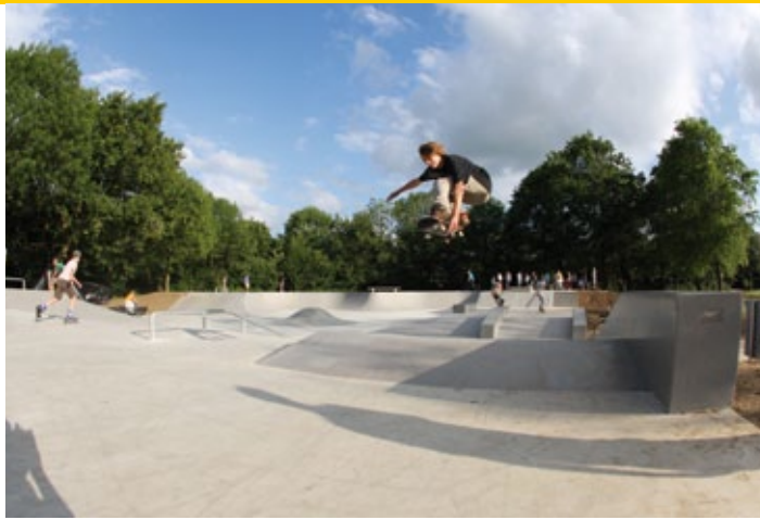
Skate park in Hardenberg (NL)