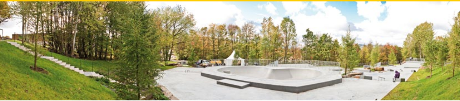
Panoramic view onto the Skate park in Hemer (GER)