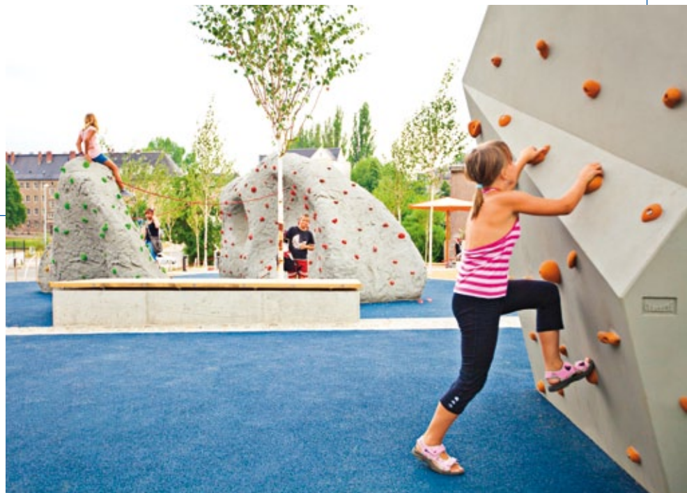
Climbing fun in each direction, Chemnitz (GER)