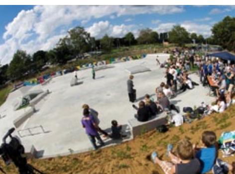
Skate park in Emsdetten (GER)