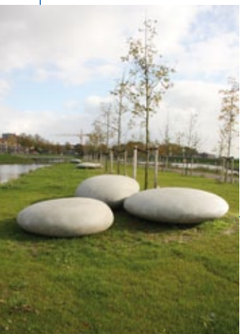
STONES in s'Hertogenbosch (NL)

These stones shall not only invite people to sit and climb on them, but they should also serve as an eye-catcher. In the meantime three of s'Hertogenbosch's parks have been equipped with our stones and there are more to come.