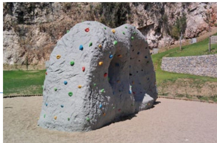
Climbing stones in Rio Seco (PT)

Located in one of the oldest parishes of the municipality of Lisbon, the village Ajuda, the Urban Park of Rio Seco was installed on the premises of the old Cal factory. Headed by landscape architect Cristina Duarte, Lisbon's City Council was in charge of this area's retrieval. The Concrete ® STONE climbing element has an attractive shape and is harmoniously integrated into the existing organic environment. That way it is a unique place for children's recreational activities.