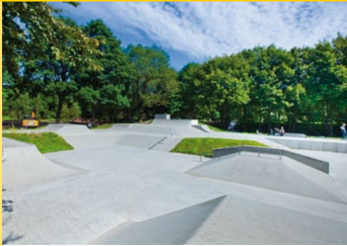
Skate park in Zwickau (GER)

For further information and downloads please go to: www.concrete-sportanlagen.de