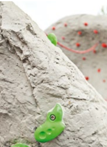
Detailed view of Climbing stones

A hybrid of sports ground, meeting point for teenagers and playground was created which was well accepted by the children and teenagers from the neighbourhood. The varied climbing options are, of course, a highlight. They offer both, stimulation for the young mountaineers to try climbing, and demanding and varied climbing fun for the advanced climbers. They are also effectively completing the picture architecturally and visually.