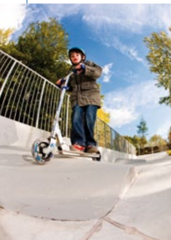
Beginner's area, Hemer (GER)

For regular updates on new parks or elements please see our newsletter at www.concrete-skateparks.com