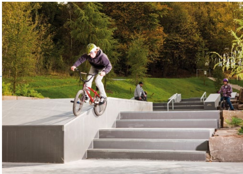
Skate park in Hemer (GER)