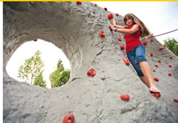
Rock combination with climbing rope in Chemnitz (GER)